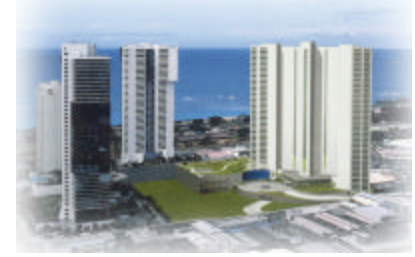
Hawaiki Tower, Nauru Tower, and the impending Koolani Tower

Construction notices and updates will be posted in the lobby as needed. We appreciate your patience during this disruptive construction phase. When finished, residents and visitors will be able to enter and exit on Ala Moana Boulevard.